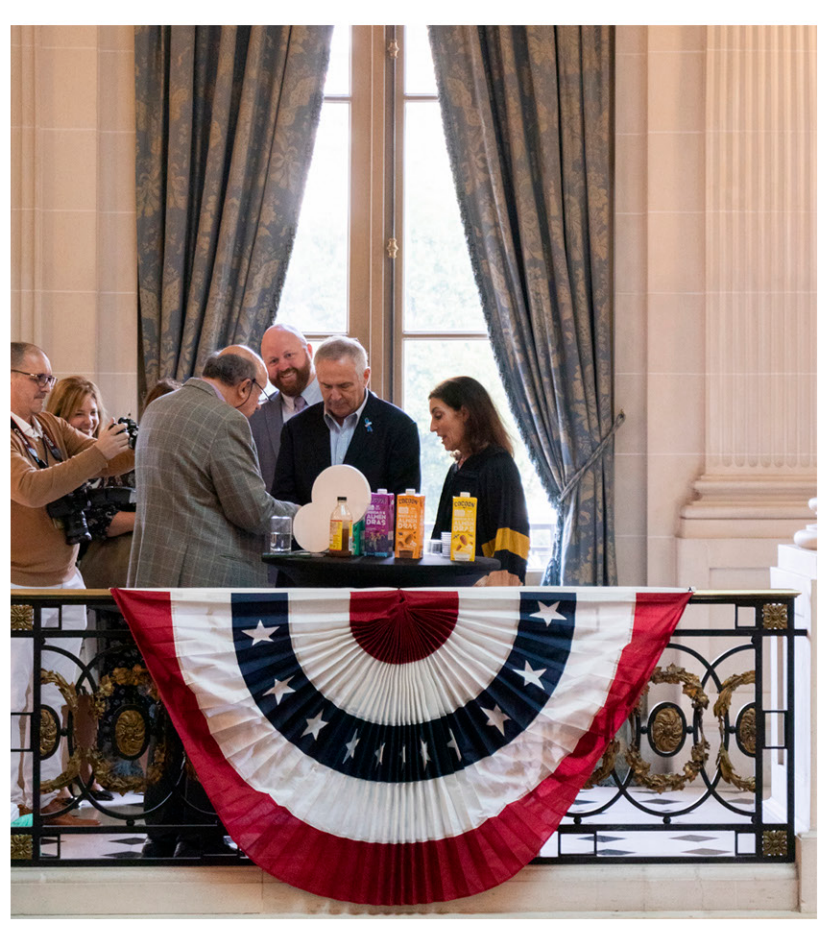
THE AMBASSADOR MET ARGENTINE IMPORTERS